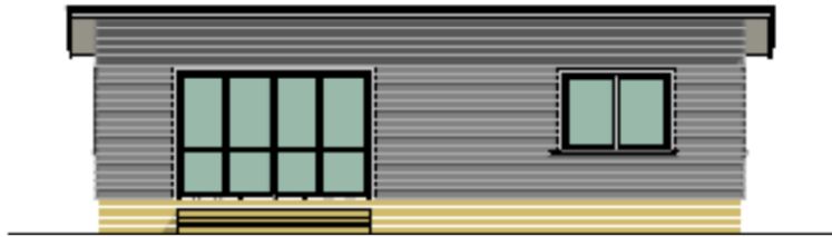
Proposed Elevation Three Scale: 1:100