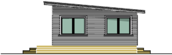
Proposed Elevation Two Scale: 1:100