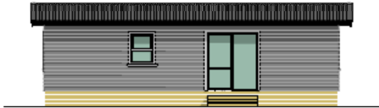
Proposed Elevation One Scale: 1:100