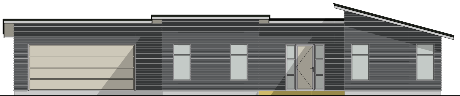
Elevation Two Scale: 1:100