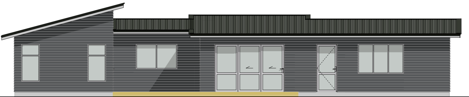
Elevation Four Scale: 1:100