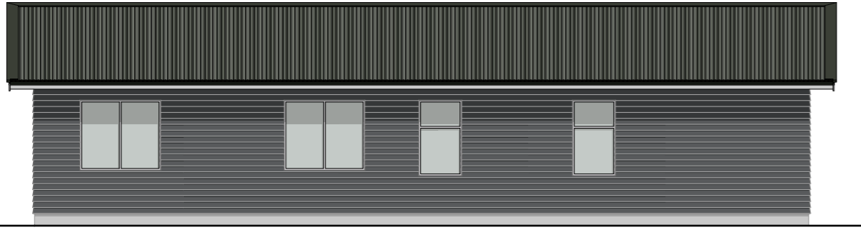
Elevation One Scale: 1:100