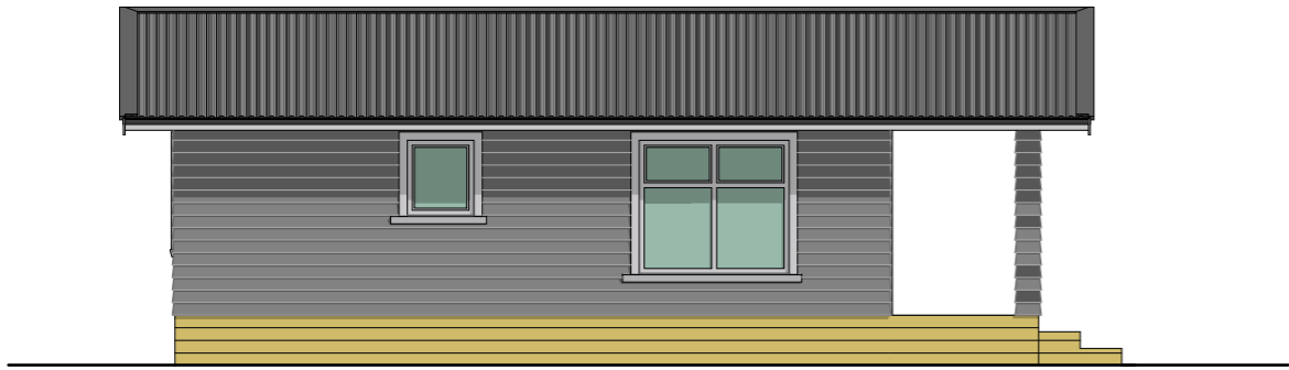
Proposed Elevation Three Scale: 1:100