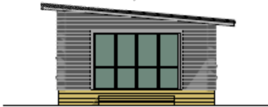
Proposed Elevation Two Scale: 1:100