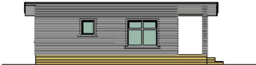
Proposed Elevation Three Scale: 1:100