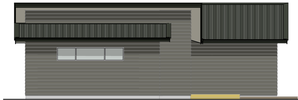
Elevation Three Scale: 1:100