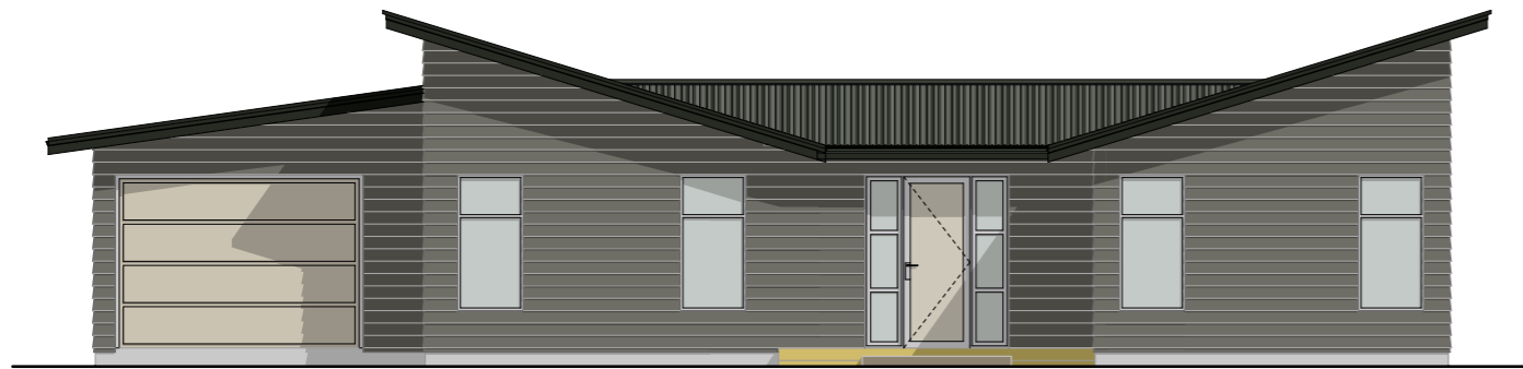
Elevation Two Scale: 1:100